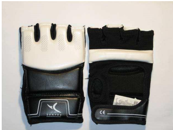
GLOVES (FROM 14 TO 17 YEARS OLD)

Another type of protections will be allowed if they offer the same level of protection.